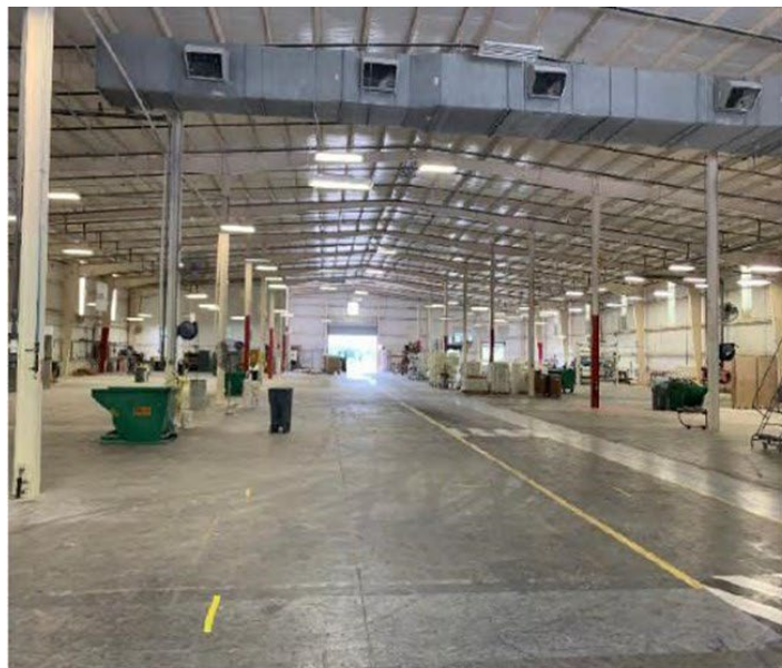
SHOP LOOKING NORTH