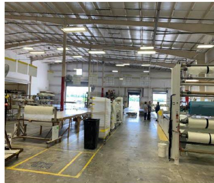
SHOP LOOKING SOUTH